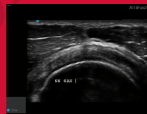
Image 6. Supraspinatus Short Axis 6 Months