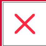
Image 2. Schematic of processing harvested adipose tissue into microfragmented adipose tissue (MAT)