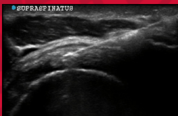
Image 4. Supraspinatus Short Axis Week 1