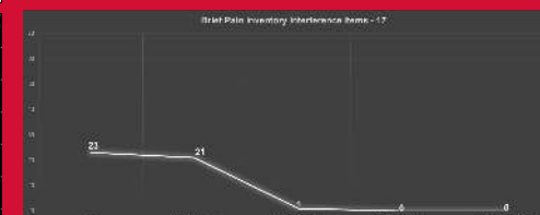
Figure C. Results of BPI-I7