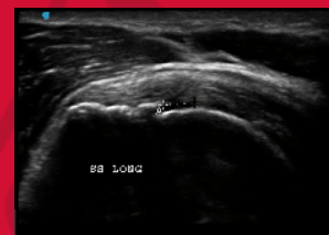
Image 5. Supraspinatus Long Axis 6 Months