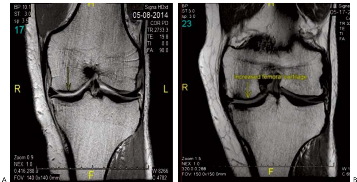
Figure 3. A, MRI prior to treatment revealing medial compartment degeneration (arrow). B, MRI 6 months after treatment with widening of the joint space and improved signal and thickness of the cartilaginous tissue (yellow arrow). MRI prior to treatment reveals a thinning articular cartilage measured by Radiologist to be 0.75 mm. MRI taken 6 months post treatment reveals an improved thickened articular cartilage measured by Radiologist at 1.5 mm of cartilage.

Carlo Tremolada, MD for training. Barbara Krutchkoff for help designing the IRB study, and editing the paper. Silvia Versari for help editing the paper.