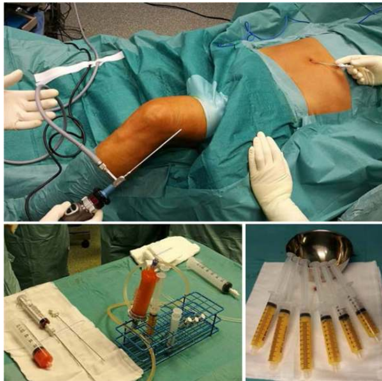
Fig. 1 Lipogems® system. Top) surgical setting. Bottom left) device. Bottom right) final product

adverse events, such as fever, infections, and excessive swelling of the knee.